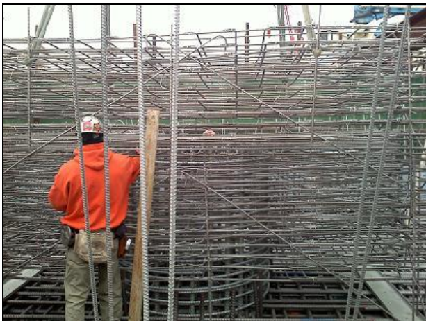
Salit supplied 1,557,910 lbs. of 2205 Duplex rebar for the Sakonnet River Bridge

Stainless steel supplied by Salit Specialty Rebar was specified for the new Sakonnet River Bridge that spans the Sakonnet River in eastern Rhode Island.