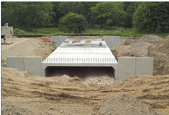
Rebar dowels pre-attached to reinforcing cages of Quick Span end units.

Hanson Pipe & Products Canada, Inc produced the precast Quick Span with a pre-welded reinforcement assembly. It was installed in Waterloo, Ontario immediately north of the University of Waterloo campus by E & E Seegmiller Limited, contracted in March 2004 to undertake the Regional Road 50 (Northfield Drive) widening. Included in the $5.6 million contract was the Westmount Road extension from Northfield Drive to Bearinger Road. The four-lane extension passes through the southern extremity of the Laurel Creek Conservation Area and crosses Laurel Creek. The width of the travelled road and design elements required by the Grand River Conservation Authority made a three-sided precast concrete structure the best alternative for the crossing.