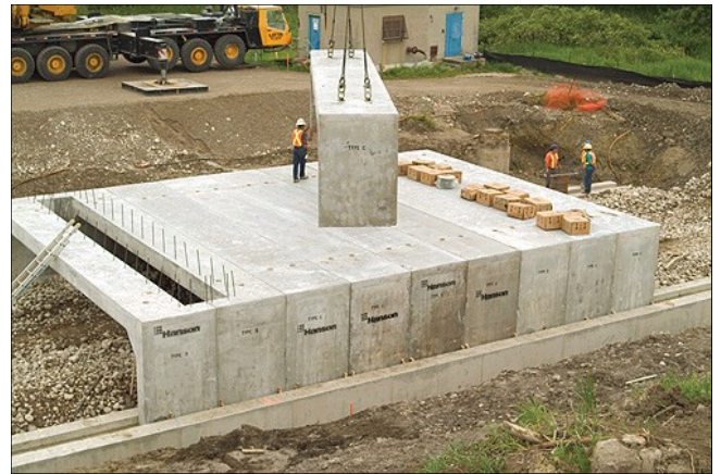
Two special unit reinforcement assemblies designed for a light portal in the structure.

Design flows of Laurel Creek through all seasons, as well as wildlife passage are accommodated by the structure. It was designed with a light portal in the centre for placement in the road median, and a cobble bed to enhance the aquatic ecosystem of the stream. StelCrete delivered two special assemblies for the cast-in place portal as well as assemblies for the concrete barrier walls with rebar dowels pre-attached to the reinforcing cages. Hanson's casting method meant that expensive dowel bar couplers could be substituted with normal rebar projecting through the top of the precast deck. Assemblies were also provided for 8 wing wall units, 20 typical units, and two narrow units to meet the overall culvert length specified on this project.