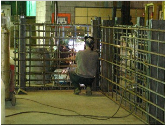
StelCrete is fully certified by The Canadian Welding Bureau (CWB) to CSA Standards.

ucts produced, and the second standard covers products that incorporate structural shapes, such as cast-in hardware for concrete work. Domestic steel is used in the assemblies and is CSA-certified under standard G30.18, "Billet-Steel Bars for Concrete Reinforcement."