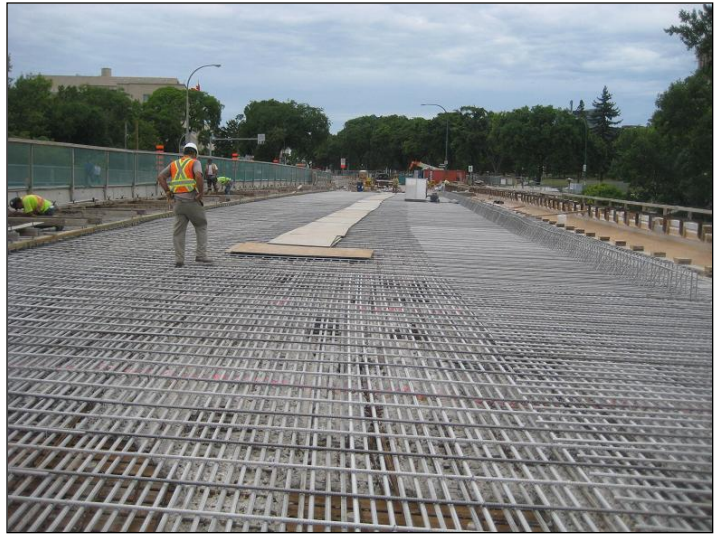
500,000 pounds of UNS S24100 (XM-28) used for bridge deck rehabilitation.

The deck required 500,000 pounds of grade ASTM A955 type UNS S24100 (XM-28) stainless steel rebar which was pre-bent and cut, then shipped to the site for assembly by Cowin Steel Co. Ltd.