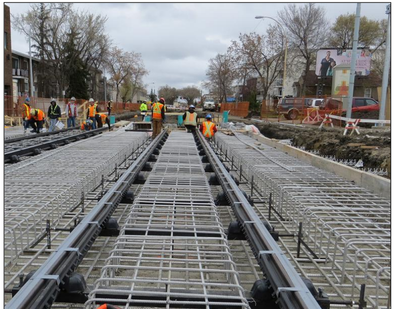
2,000,000 pounds of ASTM A955 UNS S24100 (XM-28) stainless steel supplied to A&H Steel

The project consisted of constructing the rail bed, a tunnel, various stations, and special roadway crossings over a 3.3 km right-of-way through the City.