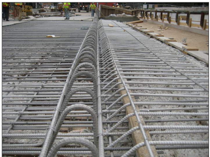
Stainless steel rebar products shipped to Cowin Steel Co. Ltd. for assembly.