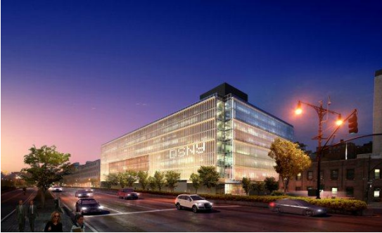
Manhattan Districts 1/2/5 Garage and Salt Facility

Source: http://www.architizer.com/en_us/projects/view/manhattan-districts-125-garage-and-salt-facility/12194/